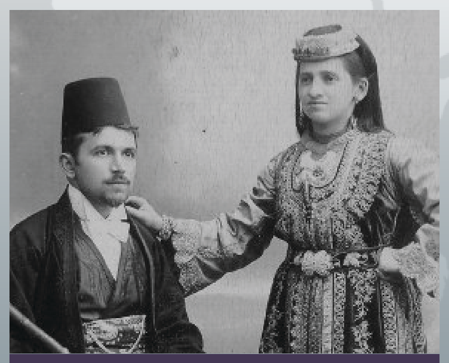
Sephardi Jewish couple from Sarajevo

The first Jews who came to America were Sephardic Jews. After fleeing the Inquisition they found refuge in Amsterdam. They were