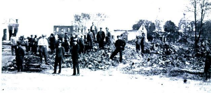
לאחר חרלה הגדולה בשנת 1934

Widok pogorzeliska pożaru z dn. 5 maja 1934 r. we Władzimircu.