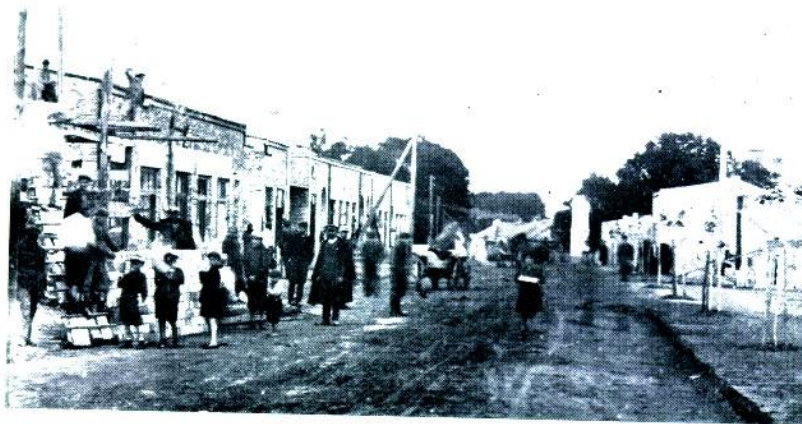
העיירה בבנייה לאחר חרלה