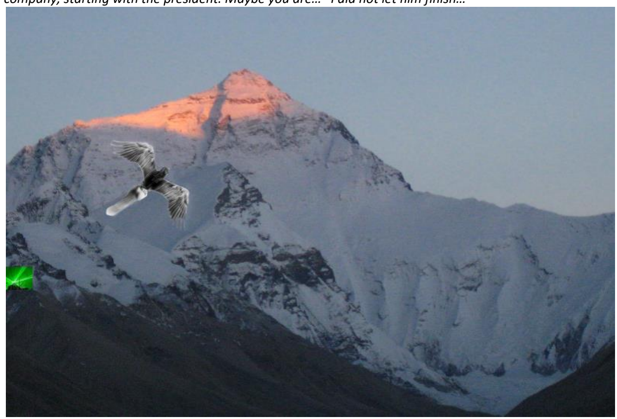
Read a complete story in a book: http://ITofTheFuture.com